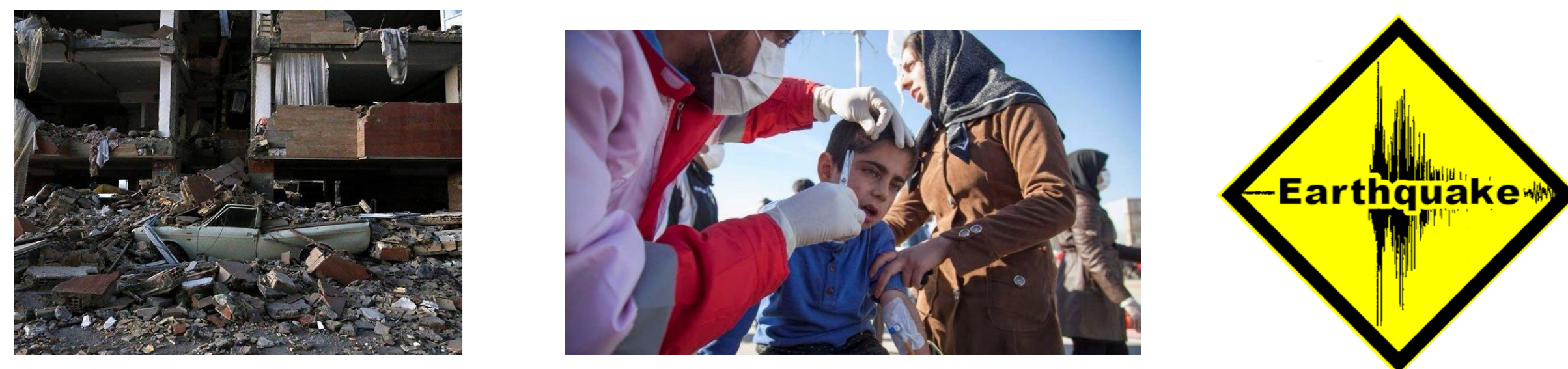
Social media images generated by users

Images generated from social media users come up with two challenges : (i) Volume of data (ii) Inherent complexity to analyze (iii) Irrelevant with the topics